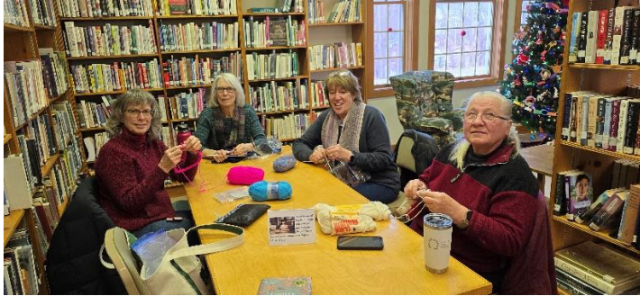
Knitters meeting up at the library on a Monday afternoon.

I had two goals for programming in 2024: form a cookbook club, and begin a book club. The "Cookbook Club" began in February 2024 and the participants planned to make the program a bi-monthly meeting. There were 5 sessions and a total attendance of 38 people. The "Neighborhood Book Club" got its start in October 2024 and the readers meet monthly. There were 3 meetings and a total attendance of 12 people.