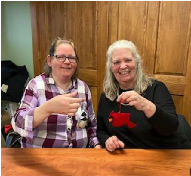
Happy participants that went home with their hand made felt bird ornaments for the holiday.