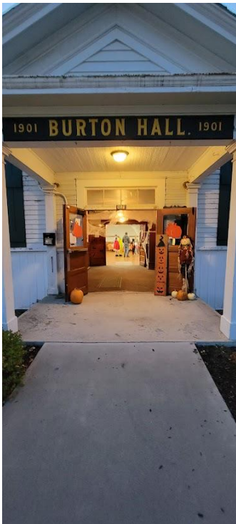
Many families stopped at Burton Hall on Halloween to participate in the "Community Trick-or-Treat".

The "Community Trick-or-Treat" held at Burton Hall, sponsored by the library and collaborated with the Town of Easton, was popular again in 2024. The library's table contributed book-themed stickers and bookmarks for children. Ninety-two people visited the building to show off their Halloween costumes and take home goodies from the community volunteer tables.