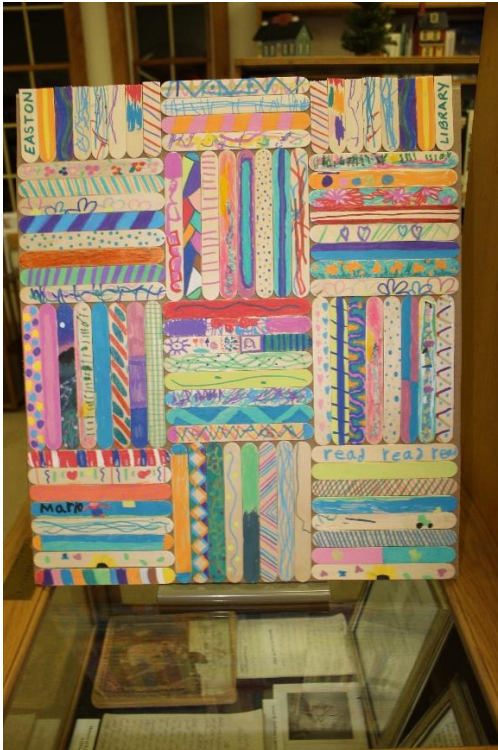
Popsicle Stick Community Quilt on display before its official framing.

Approximately thirty-seven people of all ages participated in a "Popsicle Stick Community Quilt". During the summer reading program patrons of the library were asked to embrace their creativity with collaborative art by decorating popsicle sticks with geometric designs, doodles, or inspirational messages. At the end of the summer, the popsicle sticks were assembled into colorful squares, and framed, and it is now on display in the children's area of the Easton Library!