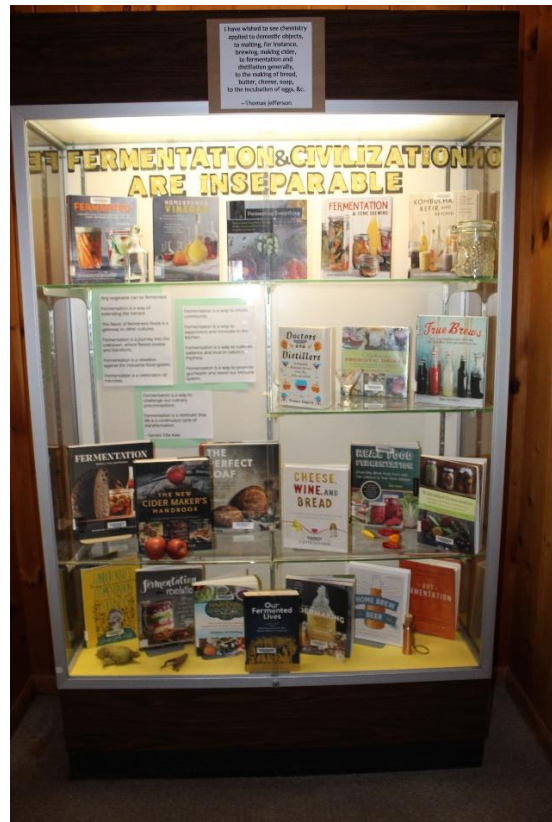
One of the many popular displays created by Amaris.