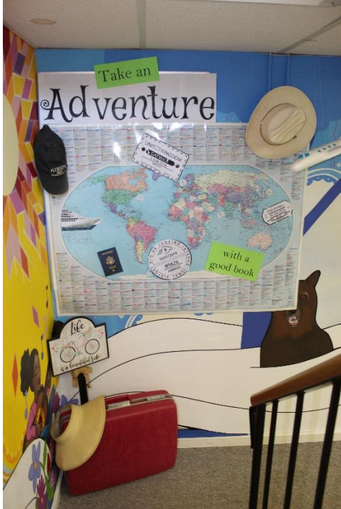
Barb's "Adventure Begins at Your Library" summer reading program presentation.