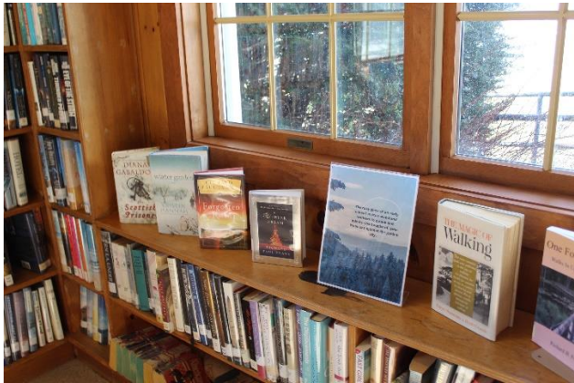
One staff member Doris's book displays.