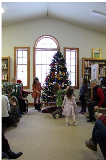
Children enjoyed decorating the library's Christmas tree.

The Friends of Easton Library held the annual "Tree Trimming" party in December and sixteen people from various families joined in the celebration. The children who attended hung ornaments on the library Christmas tree, Mrs. Clause read a Christmas story, a few Christmas carols were sung, the winners from the Election Day Bake and Book Sale raffles were picked, and the children went home with a few holiday treats.