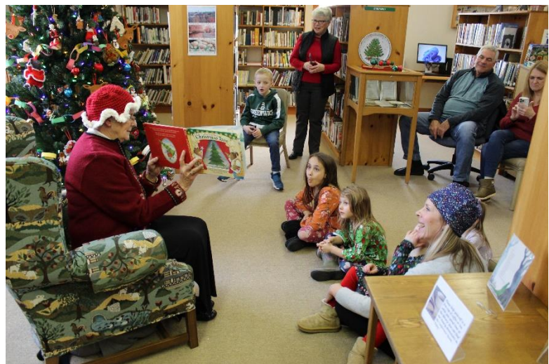
"Mrs. Claus" read a holiday story to the families at the annual tree trimming event.