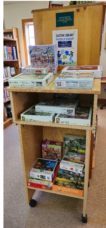
The ever-popular "Puzzle-Swap".