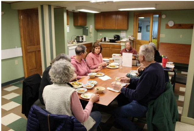
The first Cookbook Club Meeting was held in February, featuring Mediterranean and Maple recipes.

I had two goals for programming in 2024: form a cookbook club, and begin a book club. The "Cookbook Club" began in February 2024 and the participants planned to make the program a bi-monthly meeting. There were 5 sessions and a total attendance of 38 people. The "Neighborhood Book Club" got its start in October 2024 and the readers meet monthly. There were 3 meetings and a total attendance of 12 people.