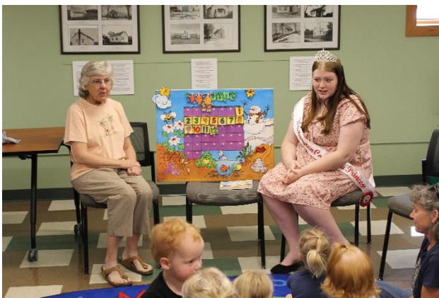
The Dairy Princess visits Easton Library Story Hour

There was continual good support of programs. The favorite by caregivers and children birth to five years old, by far, was Story Hour at the library. In 2024, Story Hour met 33 times and there was a total of 466 people in attendance. The knitters met a total of 44 times with an attendance of 121, the Osteobusters group met a total of 49 times with an attendance of 722, the mahjong group met 35 times with an attendance of 145, and the literacy group met 29 times with an attendance of 48.