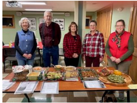
Appetizer & Cookie Exchange at Cookbook Club in December

The library has a teen volunteer who requested to help in the library in August. Our teen assists the staff bi-weekly. The library provides leadership opportunities to this young person by teaching work ethics and social skills in a professional setting. It is important to develop and foster relationships between our teen volunteer, the library, and the community.