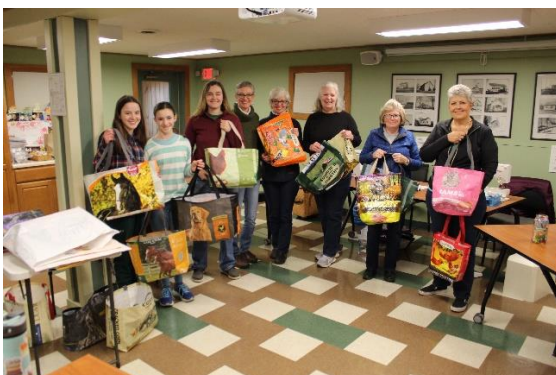
Participants displaying their newly made reusable shopping bags!