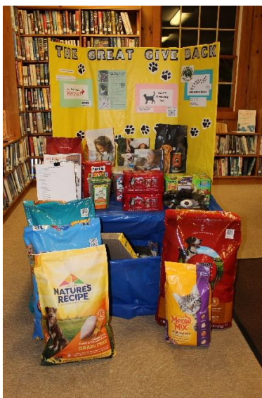
“Great Give Back” pet donations for four local animal rescue groups.

For the third year in a row, the Easton Library and the Greenwich Free Library collaborated to participate in the “Great Give Back”. The Great Give Back’s mission is to provide a day of opportunities for patrons of Public Libraries of New York State to participate in meaningful, service-orientated experiences. Our two libraries joined together to support local animal rescue groups, for a successive year. At Easton Library, thirty-two patrons donated one hundred and ten pet items to the cause.