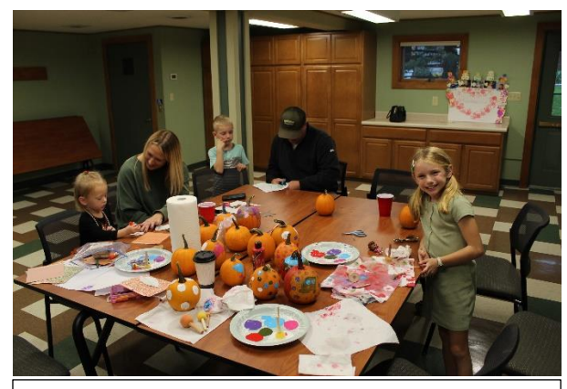
Happy Mail Club decorating pumpkins for seniors of Easton