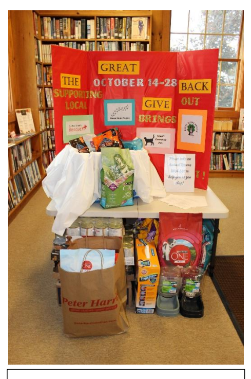
188 items were collected for the Great Give Back for local animal rescue organizations