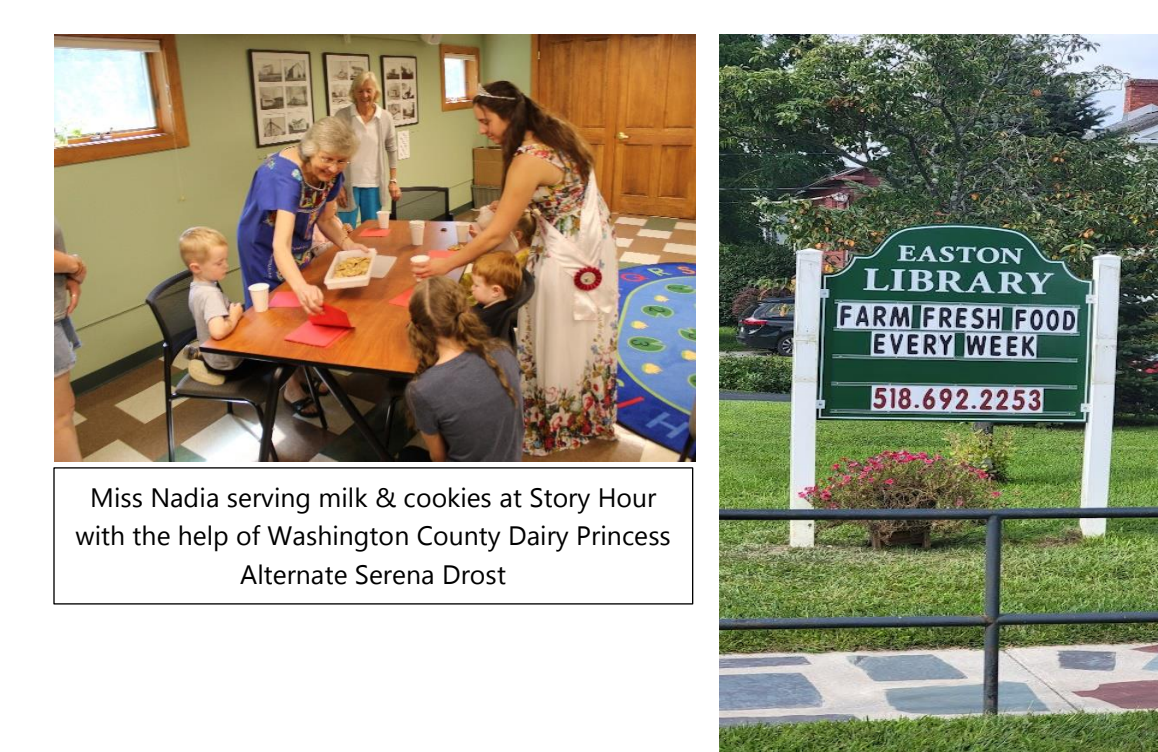
New sign purchased by the Friends of Easton Library

I am so proud of our little library! There was a huge amount of activity at the library last year following the pandemic, and people wanted to get out of the house and connect with the community. We experienced a large increase in both attendance and number of programs scheduled in 2023. These included weekly programs, such as the pre-school story hour, osteobusters, mahjong, and knitting, as well as a variety of solo programs. The Friends of Easton Library purchased a new sign for the library last summer to help us promote upcoming events. Easton Library is an important community hub.