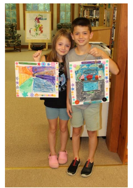
Two youngsters learned how to frame their posters for the Washington County Fair