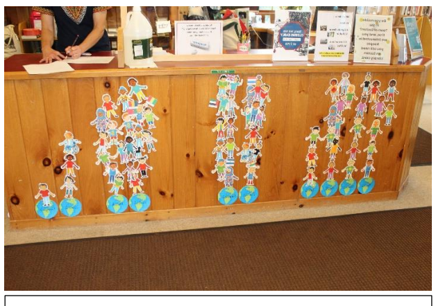
All Together Now summer reading progress in front of the circulation desk