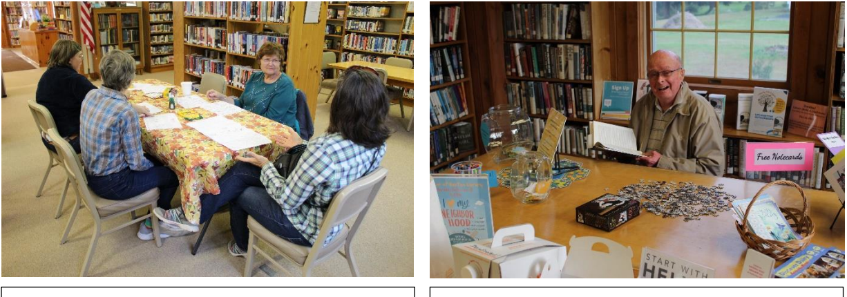
Library goers enjoying good conversation & coloring together on National Good Neighbor Day

The library hosted a National Good Neighbor Day on September 28<sup>th</sup> where 28 people gathered to enjoy snacks provided by the library, chat, group color, meet neighbors, and play board games and puzzles. This national holiday was signed into law in 1978 by then-president Jimmy Carter.