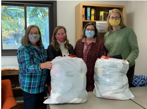
The Great Give Back Collaborating with the Greenwich Free Library