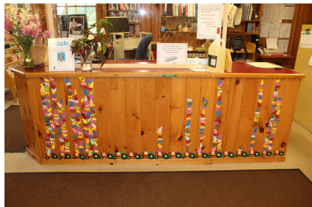
Book Reading Tracking for participants