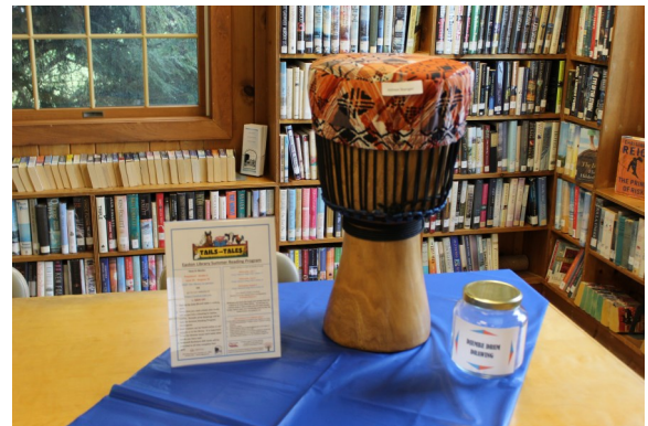
Tails and Tales Summer Reading Program The djembe was a reading incentive prize.