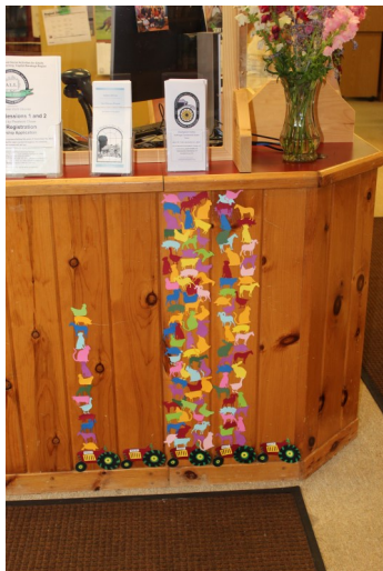
Tails and Tales Summer Reading Program